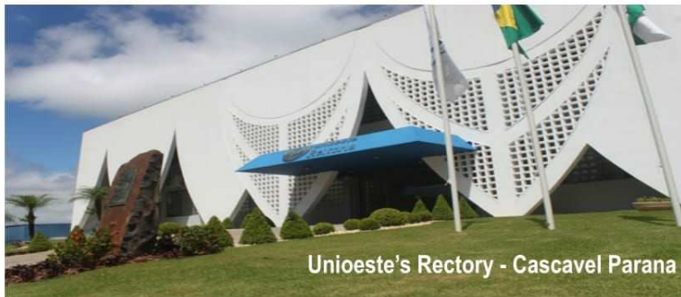
Unioeste's Rectorcy - Cascavel Parana

After over 20 years of waiting, Unioeste finally inaugurated the university restaurants. This huge achievement, which is considered one of the most important factors for student permanence in the University, was made possible after partnerships between Unioeste and the federal government to make one restaurant in each campus. In the city of Toledo occurred the first inauguration, in September 2016. Next was in the campus of Marechal Cândido Rondon on April 2017, followed by Cascavel and Francisco Beltrão in that same month. All of them charge US$ 0,74 per student, while the University pays US$ 1,19 per meal trough an agreement. For general staff, the fee varies between US$ 1,51 and US$ 2,09. Foz do Iguaçu followed the same path, with two new Restaurants inaugurated in august 2017 – one for the main campus and another for Itaipu's technological center.